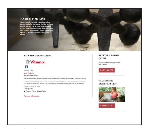
Sample of Exhibitor Listing on website

FEB. 24-25 & FEB. 28-MARCH 4, 2018 | DUKE ENERGY CONVENTION CENTER